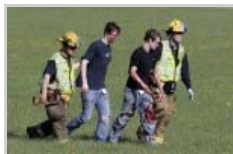
Emergency crews help victims during the disaster drill, Saturday May 7, 2011 at the Eastern Iowa Airport in Cedar Rapids.