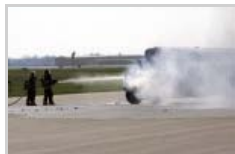
Fire crews put out a bus used to represent the airplane during the disaster scenario, Saturday May 7, 2011 at the Eastern Iowa Airport in Cedar Rapids.