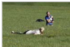
Saturday May 7, 2011 at the Eastern Iowa Airport in Cedar Rapids.